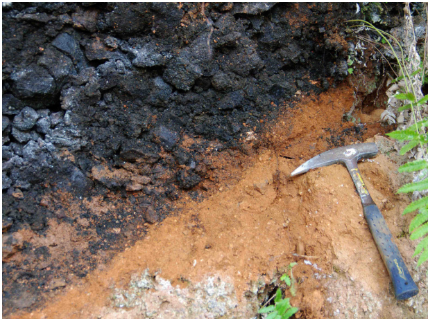
Photo. 4. Samples for dating were taken from the contact between granitic basement (lower) and scoria fall (b) (upper).

20 MAR (Boating on Lake Nyos 2 and natural dam): In the second boating, we newly recognized two different types of basaltic magmas. Although major component of juvenile materials from Nyos maar consist of relatively porphyritic basalt, minor amount of aphyric basalt with chilled margin is found in scoria fall (b) and pyroclastic surge (d). We also obtained soil samples for radio carbon dating at northern lakeshore (Photo. 4) and natural dam site.