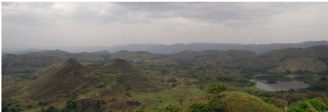
Photo. 2. Overview of scoria cone (left) and Lake Njupi (right) from the top of the northern wall of Nyos maar.

material buried the river from Njupi Lake, but large-scale landslide of the base surge deposit on the northern slope of Nyos maar also blocked the outlet from the ancient lake Njupi, which might be the main cause to form the present Lake Njupi ( Photo. 2 ).