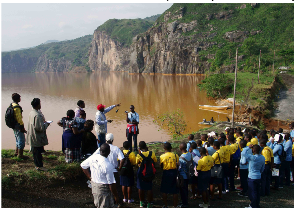
Photo. 3. We had a chance to educate for high school students coming to geological excursion.

19 MAR (Distal tephra layers): We described an outcrop located on approximately 2 km northwest of Lake Nyos. Distal facies of scoria fall (b) and pyroclastic surge (d) can be recognized here. Scoria fall (b) directly covers the weathered granitic basement. The basal part of pyroclastic surge deposit (d) consists of alternating parallel layers of volcanic sand and fine ash. The latter is composed mainly of small accretionary lapilli.